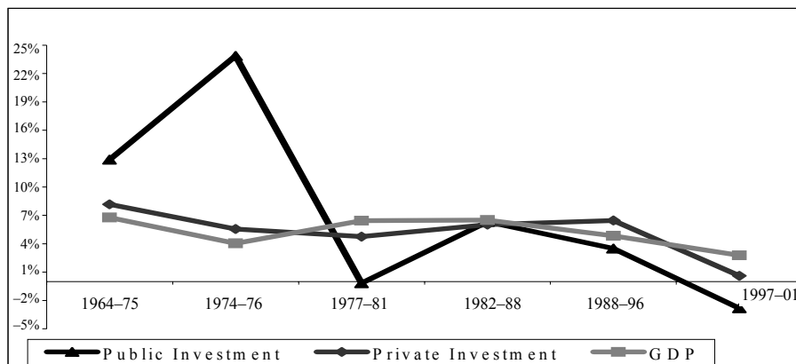
Fig. 1. Growth Rates.

The rising trend in public investment during 1964–1973 can be explained partly by the pro-industrial policies, especially in the import-competing sector. The policies of liberalisation and deregulation along with higher public investment resulted in higher level of GDP growth, public and private investment. Separation of Pakistan, oil price shocks, and the new economic agenda of the then new government changed the economic environment of the country during the time-period of 1973–76. New economic policies focused mainly on enhancing the size of public sector. The process of nationalisation, which started in mid 1970s, resulted in a massive enhancement in the public capital stock. Along with this, the economy experienced a level of relatively lower private investment and lower growth rate of GDP. Since 1977, the process of denationalisation, liberalisation and privatisation started. The main purpose of these policies was to boost private investment in the economy and to enhance economic development through market forces. These policies resulted in decline in the growth of public investment.