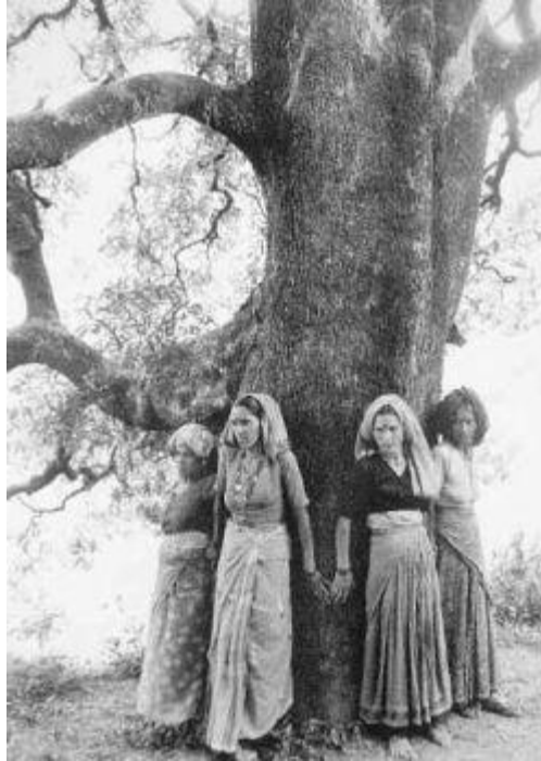
Fighting for a cause...the Chipko movement

The Indian feminist environmentalist analysis differs from that of Ecofeminism in the following ways: (a) women are not alone in having a special stake in environmental regeneration; (b) what's good for the environment may not be good for the women in question and vice versa; (c) the Indian feminist environmentalists do not advocate a retreat to indigenous social and knowledge systems since that would not alter national or international power structures (Mitter, 1995); and (d) the ideological linkages between women and nature in the North (i.e., both have been ideologically related and oppressed by patriarchal economy) do not prevail in the South, where the emphasis is on 'the material basis for this link' (Agarwal, 1992).