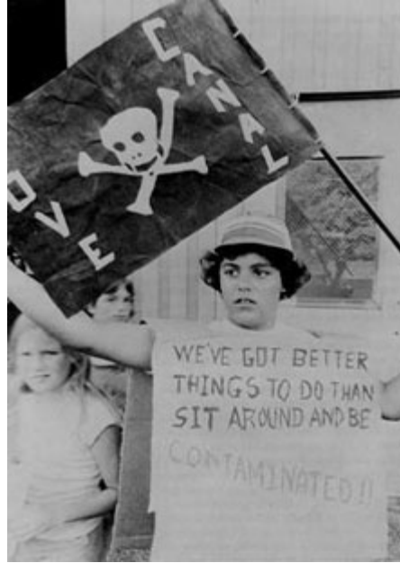
Love Canal resident protests toxic dangers

The experiences of the residents of Love Canal have come to represent the fears of people in industrial societies about the hidden dangers that surround them. However, it was not until women had vandalized a construction site, burned an effigy of the mayor and been arrested in a blockade that government officials began to take notice. (Seager 1993)